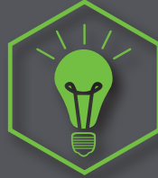
CREATIVITY & INNOVATION

Your ability to imagine, develop, and encourage, ideas in ways that are new. For example, we use this skill to discover better ways of doing homework, school projects and our house chores by finding ways to make them more enjoyable.